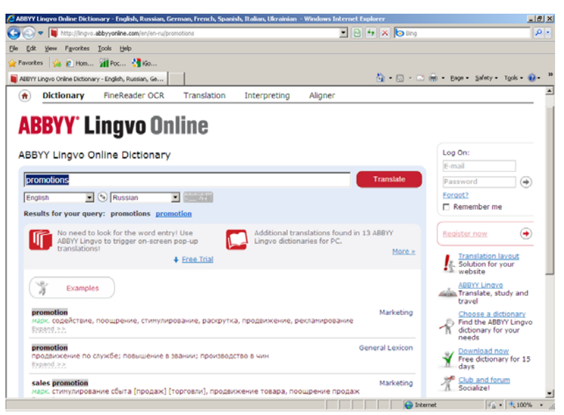
Figure 1. ABBYY Lingvo Server example

The ABBYY Lingvo Server technology makes it possible to run and control promotions on the website running online dictionary. This feature is useful for dictionary publishers, who can easily manage presentation of the content thank to the digital marketing model built inside the technology. Any type of dictionary view is possible on the website: free lookup, trial lookup, restricted lookup, closed lookup or subscription-based payable lookup. So different types of promotions and advertising